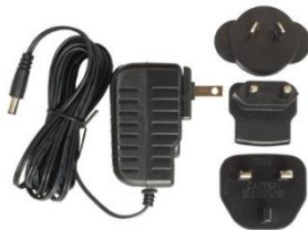
Figure 5: PWR-ACDC-5V2A