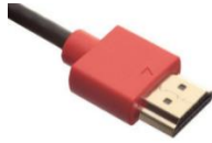
Figure 3: HDMI Cable