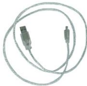
Figure 4: EXTMUSB3FT